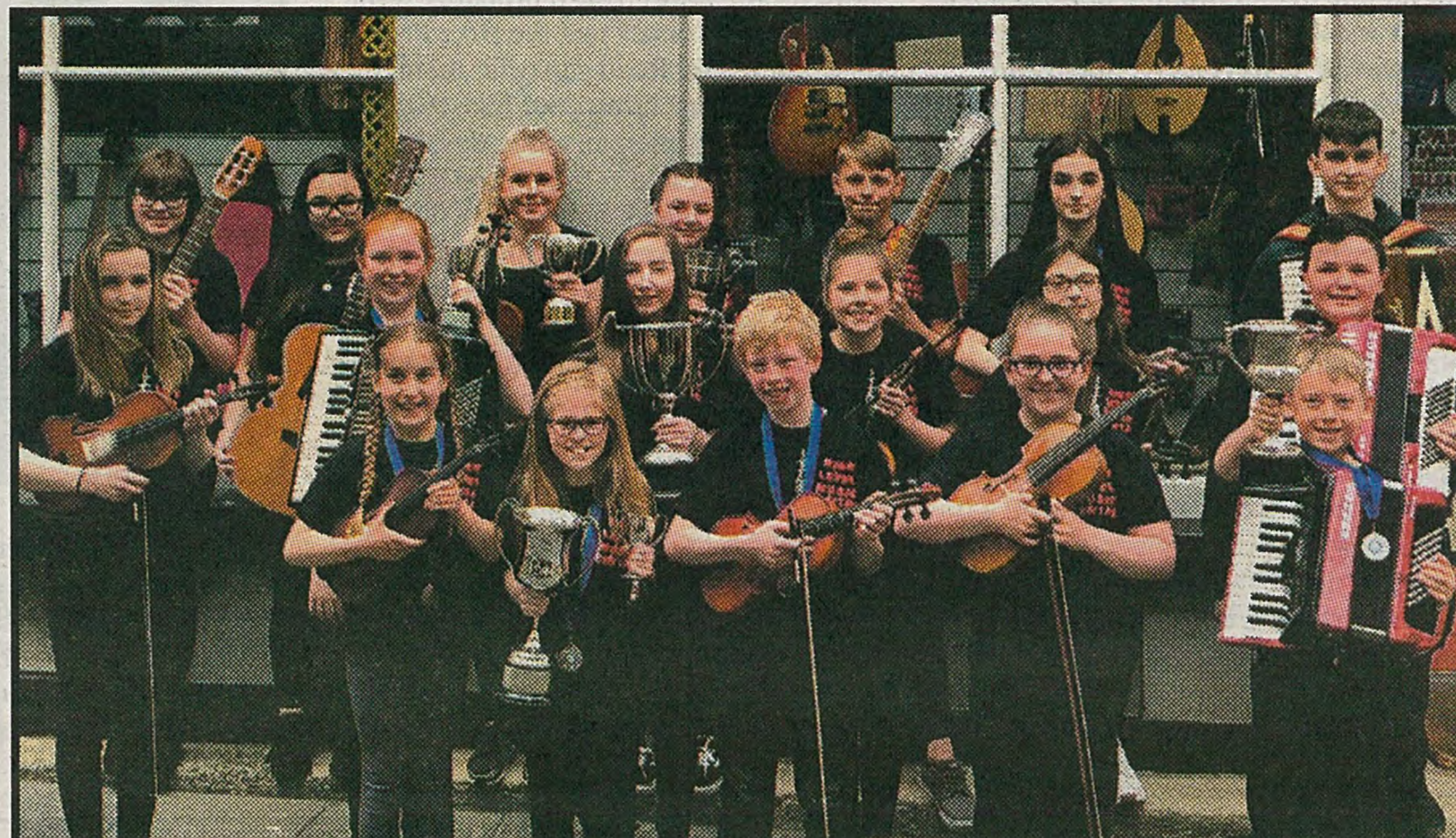
The High Level Music students who performed brilliantly in Banchory.