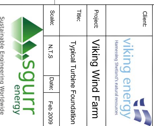
TYPICAL SECTIONAL ELEVATION ON WIND TURBINE TOWER BASE